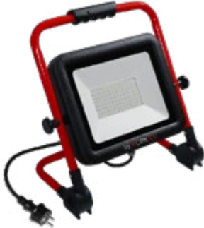
PROIETTORE CON MANICO FLOODLIGHT WITH HANDLE