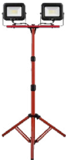
2 PROIETTORI CON TREPPIEDI 2 FLOODLIGHTS WITH TRIPOD