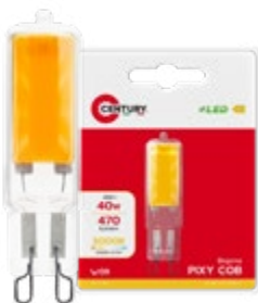
Ø 14 x 64 mm - 10 g