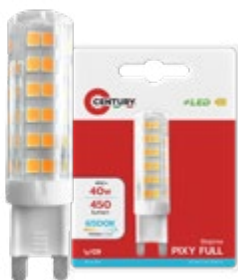
Ø 16 x 60 mm - 14 g