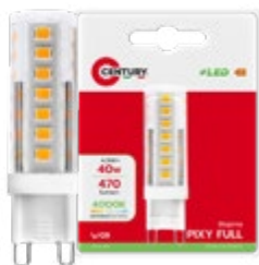
Ø 16 x 60 mm - 15 g