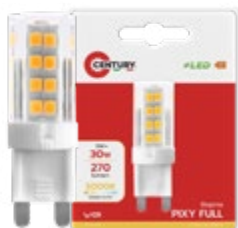
Ø 15 x 48 mm - 11 g