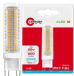
Ø 16 x 75 mm - 22 g