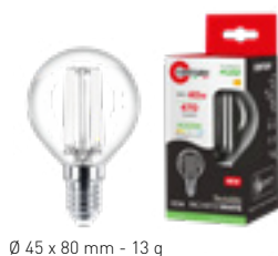
Ø 45 x 80 mm - 13 g