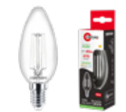
Ø 35 x 98 mm - 14 g