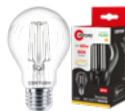
Ø 60 x 108 mm - 33 g