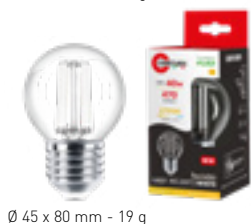
Ø 45 x 80 mm - 19 g