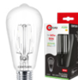
Ø 64 x 140 mm - 43 g