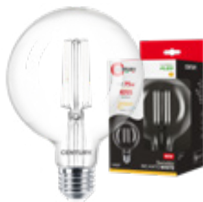
8-9 W - Ø 95 x 140 mm - 50 g 13 W - Ø 125 x 172 mm - 102 g